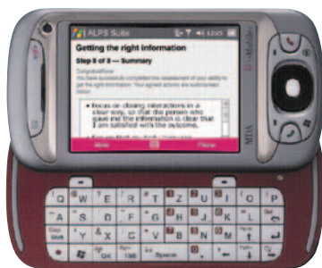
The accessibility improvements will develop the Mobile Client's interface, allowing users to customise the display, including changing font size and style and resizing the screen

The first of the funded projects will enable students to move data between their own e-portfolio and other systems, giving them scope to import and export assessment responses, as well as other files and learning resources. This focus on e-portfolio interoperability will allow students to transfer evidence of their knowledge and competences to commonly used e-portfolio systems that are mapped to a shared standard. Plus, as more e-portfolio systems conform to the new standard, the benefits for students will increase; instead of losing their e-portfolio when they leave university, the potential is there for them to transfer all the data to the system employed at their new workplace.